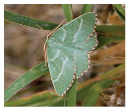
Sussex Emerald Moth

For daily wildlife updates, especially the bird sightings use the Dungeness Bird Observatory website www.dungenessbirdobs.org.uk